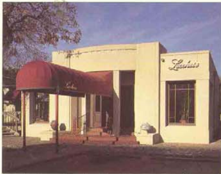
The famous Lucchese Shop in San Antonio, Texas

And the reputation they inspired is still spreading.